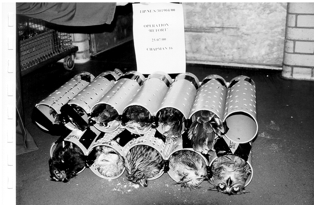
Often smugglers try to conceal live animals in their baggage. These birds of prey were found in July 2000 at Heathrow Airport, UK, in the luggage of a passenger travelling from Thailand.

Several of the requirements of the EU regulations are stricter than existing comparable regulations in the Acceding States, for example, those requiring the marking of Annex-A specimens or certificates for internal EU trade (Article 10 certificates). Consequently, there is a risk that some methods of illegal trade, such as mis-declaration and permit fraud, are likely to occur more often in the EU after accession.