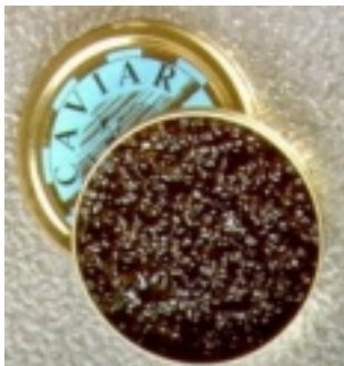
The EU is the largest importer of caviar

The EU Member States constitute the largest importer of caviar , importing a total of 572 t between 1998 and 2002 (Table 1). France and Germany, the largest importers, imported 210 and 197 t, respectively. The Acceding States reported total imports of around seven tonnes of caviar for the same period. However, for the same period, these States reported combined (re-) exports of four times that volume, of which the majority came from Poland. Whether the difference of 21 t originates from stocks that were acquired before the CITES listing (called 'pre-Convention'), as claimed by Poland for instance, is doubtful and remains difficult to verify in retrospect.