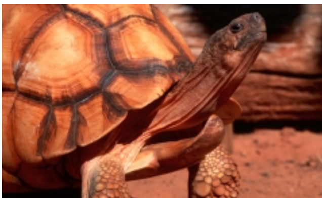
The Madagascar Tortoise or Angonoka Geochelone yniphora is one of the rarest tortoises in the world and is considered Endangered by IUCN.

According to information received from anonymous sources, several rare species of tortoises are also being kept in the Czech Republic and have been offered for sale to traders in the EU; these include, for example, two specimens of the Madagacar Tortoise Geochelone yniphora , 80 Radiated Tortoises Geochelone radiata , more than 60 Burmese Tortoises Geochelone platynota , 30 Kleinmann's Tortoises Testudo kleinmanni and 28 Flat-backed Spider Tortoises Pyxis planicauda , offered in 2003 by two traders alone. The legal status of these animals is unclear.