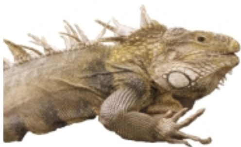
The Iguana Iguana iguana is the reptile species imported in the highest numbers by the EU.

Among the live birds imported were almost 1.6 million live parrots (see Table B in Annex II). Portugal and Spain are the largest importers of live birds within the EU, whereas Malta and the Czech Republic are the main importers of CITES-listed birds among the Acceding States (see Annex II). Interestingly, there are strong trade links between the existing and Acceding EU Member States: almost one-third of the parrots imported by the Acceding States come from the EU, whereas the great majority (92%) of the parrots exported by the Acceding States (more than 75 000 specimens) went to the EU (mainly Spain, Italy, France, Greece and Portugal). After Accession, all of this trade will be considered internal EU trade and no import or export documents will be required.