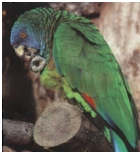
Several specimens of the Saint Lucia Amazon Amazona versicolor (EU Annex A/CITES Appendix I) are allegedly illegally kept in the Czech Republic. Of this species only 300-350 birds remain in the wild.

In recent years, the Acceding States have seized an increasing number of live parrots and reptiles, including some rare and strictly protected species. For example, between 2000 and 2002, 248 parrots were seized in the Czech Republic and 172 in Slovakia . Among them were several EU Annex-A/CITES Appendix-I listed species such as the Moluccan Cockatoo Cacatua moluccensis and the Cuban Amazon Amazona leucocephala , which is not commonly found in trade and which can fetch very high prices among hobbyists. According to Czech authorities there are several specimens of the rare Saint Lucia Amazon Amazona versicolor (EU Annex A/CITES Appendix I) being illegally kept in the Czech Republic (Anon., 2002). These birds are only found on the Caribbean island of Saint Lucia and the total population in the wild is estimated at not more than 300 to 350 birds (Juniper and Parr, 1998). The species is strictly protected in Saint Lucia (Anon., 2004b) and, according to CITES trade data, only 14 live specimens have been reported in international trade between 1975 and 2002; no imports to the Czech Republic have been reported.