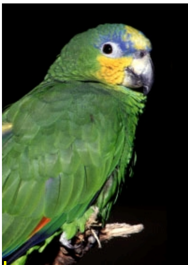
The Orange-winged Amazon Amazona amazonica . Between 1996 and 2002 the EU Member States and the ten Acceding States imported more than 65 000 live specimens.

The EU is one of the largest and most diverse markets for live animal and plant species and their products. The enlargement of the EU from 15 to 25 countries will with no doubt increase the size and importance of the EU's single market globally. Since the fall of the Iron Curtain in the early 1990s, international trade involving the Acceding States has increased and several of the countries have become significant transit points for animal and plant species destined to EU markets from around the world. The majority of that trade is driven by the demand of western European countries, but Acceding States also import wildlife from EU Member States and are important consumers of wildlife themselves.