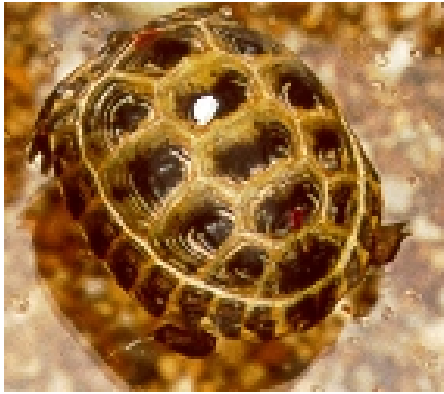
Horsfield's Tortoises Testudo horsfieldii have a wide distribution in central Asia.

among European hobbyists and adults can fetch prices of around € 200 in the EU. Live specimens of these tortoises originating from the wild have been banned from import into the EU since 1999, owing to the high mortality rates of this species in captivity. It is assumed that a significant portion of tortoises smuggled into Poland are destined to be traded to neighbouring EU countries. Hungary seems to be another important transit country for tortoises, most of which are being imported from the Balkan countries and other eastern Mediterranean countries. It is likely that most of these are intended for (illegal) re-export to western Europe. Between 2000 and 2002, Hungarian authorities confiscated 837 live specimens of Testudo hermanni that had been illegally imported from Serbia and Montenegro, Macedonia and Romania.