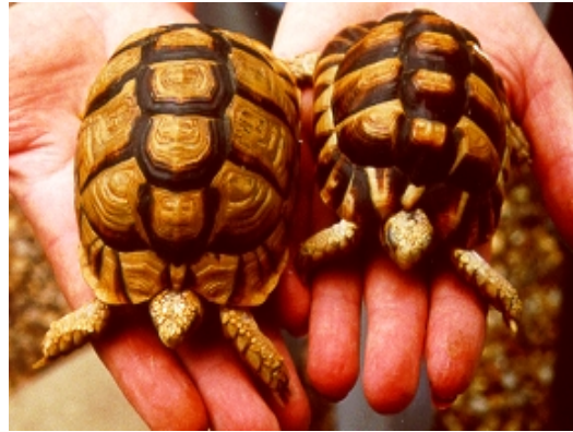
The Egyptian Tortoise T. kleinmanni is rare and considered Endangered by IUCN.

Notably, Malta and Poland imported relatively high numbers (494 specimens) of Testudo kleinmanni in recent years. The EU, in comparison, imported only 14 specimens in the same time period. This species is listed in Annex A and CITES Appendix I and hence commercial trade in wild specimens of this species should not be allowed. The species is considered Endangered by IUCN (IUCN, 2003) and it is found only in Libya and Egypt, with a very small population still surviving in Egypt. The majority of the 494 specimens (470 specimens) were imported by Malta, all imported from Libya, which joined CITES only recently (January 2003). No information regarding the source and purpose of this trade has been provided.