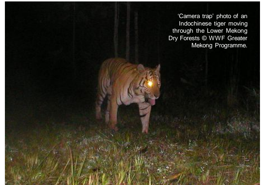
'Camera trap' photo of an Indochinese tiger moving through the Lower Mekong Dry Forests © WWF Greater Mekong Programme.

The Mekong River basin is estimated to house over 1,300 species of fish, including the endemic Mekong giant catfish, one of the largest freshwater fish in the world, the giant Mekong barb and several species of giant stingray. By length, the Mekong is the richest waterway for biodiversity on the planet, fostering more species per unit area than the Amazon. Many of the species are endemic to the region.