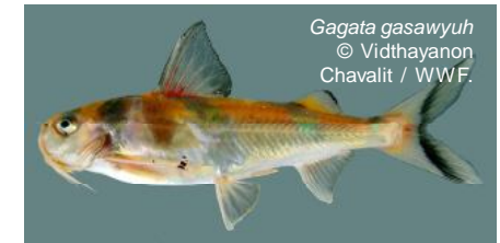
Gagata gasawuyh

Over 1,300 fish species occur in the Mekong River basin and each new scientific survey of the river and tributaries identifies new, often endemic, fish species with additional surveys of limestone caves, rapids, peat swamps and waterfalls, all adding to the known fish diversity of this mighty river.