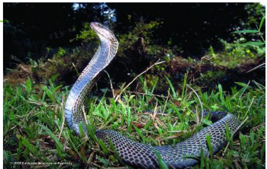
Above: Burmese spitting cobra, Naja mandalayensis © California Academy of Sciences.

In 2005, a new species of krait was discovered in Lao Cai and Yen Bai Provinces, northern Vietnam 49 . The new snake, Bungarus slowinskii , is a member of the Elapidae , a highly venomous family of snakes that includes the black mamba, cobras, fierce snake and sea snakes. The snakes have long and slender bodies with smooth scales, but vary in colouration. Bungarus slowinskii has black and white rings covering the length of its body and tail. Another elapid, the Burmese spitting cobra ( Naja mandalayensis ) emerged in 2000 50 . The species is aggressive, with a tendency to spit venom when threatened. Although endemic to the arid region in central Myanmar, the species is closely related to the Thai spitting cobra.