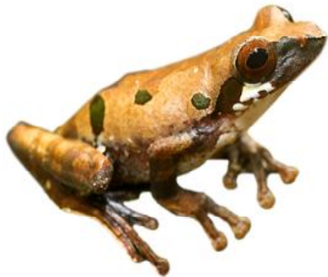
Left: Rhacophorus cyanopunctatus

The species has iridescent gold-green eyes. Also with piercing gold eyes, Leptolalax nahangensis was found at the entrance of a cave in Na Hang Nature Reserve, Tuyen Quang Province.