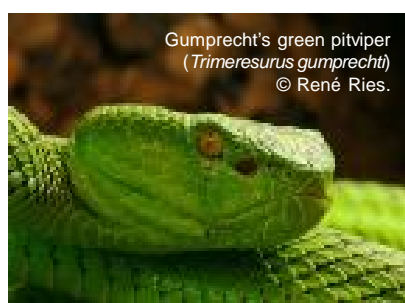
Gumprecht's green pitviper ( Trimeresurus gumprechtii ) © René Ries.