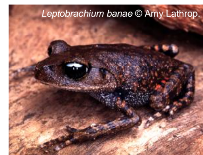
Leptobrachium banae