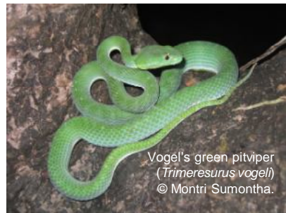
Vogel's green pitviper ( Trimeresurus vogeli )