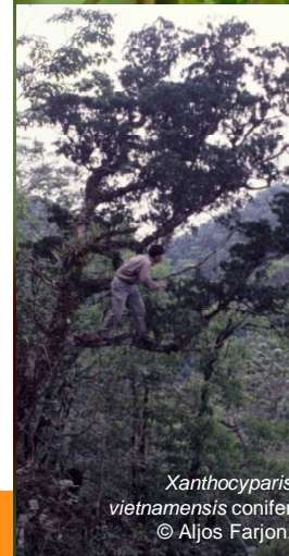
Xanthocyparis vietnamensis conifer © Aljos Farjon.