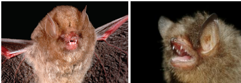
Far left: Kerivoula kachinensis woolly bat. Left: Kerivoula titania woolly bat.

Out of the several million species of animal that inhabit the planet, only a few thousand are mammals. With 15 new forest-dependent species identified in just 10 years, the Greater Mekong region certainly is an exciting and unexplored region for mammalogists.