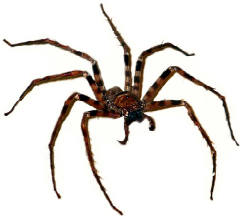
Top right: Storenomorpha anne. Right: Pseudopoda confusa. Left: Heteropoda maxima.

The medium-sized spider species Pseudopoda confusa , described in 2006 from northern Lao PDR, was collected by hand in the forests of Luang Nam Tha and Muang Sing districts.