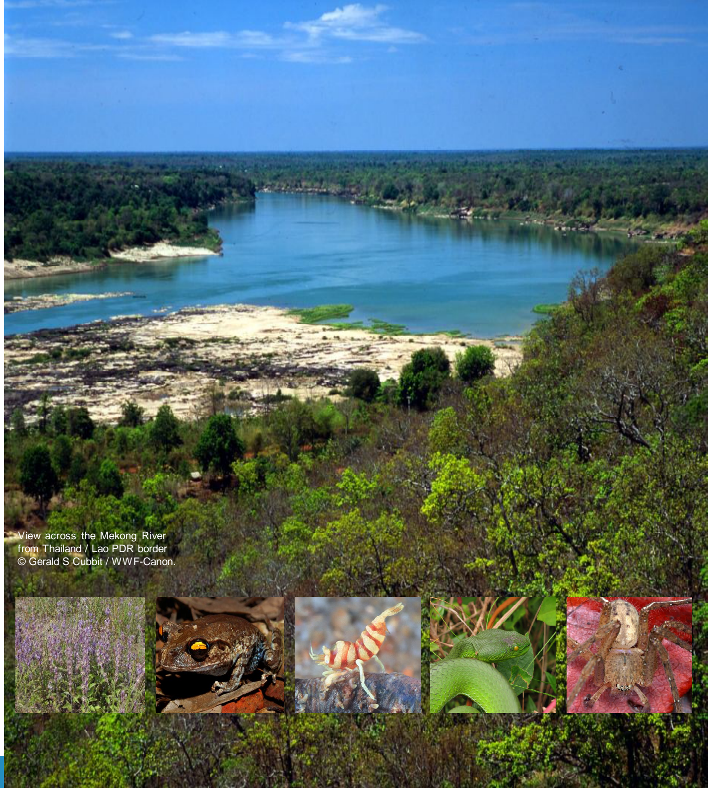
View across the Mekong River from Thailand / Lao PDR border © Gerald S Cubbit / WWF-Canon.

The material and geographical designations in this report do not imply the expression of any opinion whatsoever on the part of WWF concerning the legal status of any country, territory, or area, or concerning the delimitation of its frontiers or boundaries.