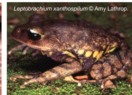
Leptobrachium xanthospilum © Amy Lathrop.