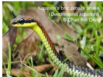
Kopstein's bronzeback snake ( Dendrelaphis kopsteini )