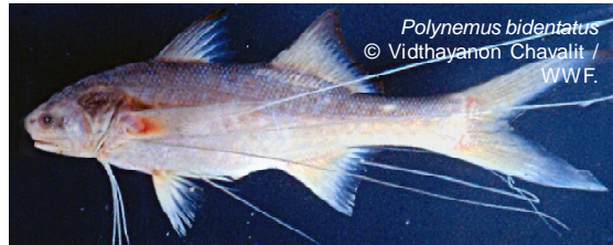
Polynemus bidentatus