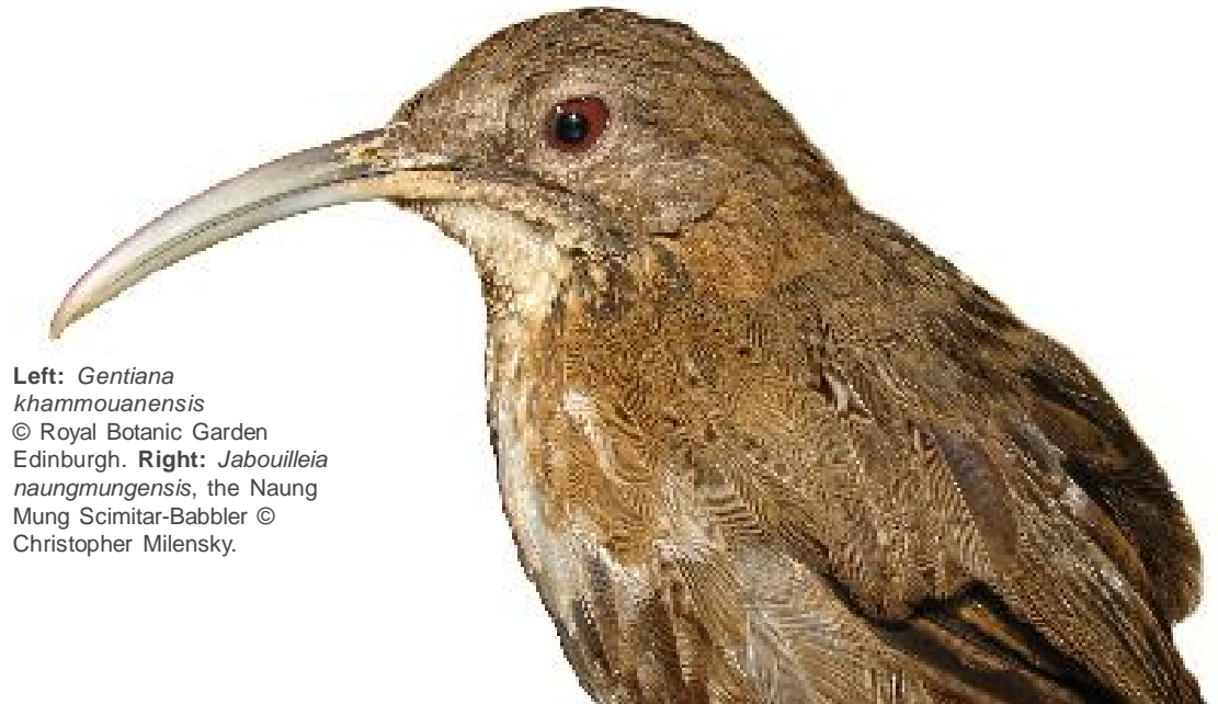
Left: Gentiana khammouanensis. Right: Jabouilleia naungmungensis, the Naung Mung Scimitar-Babbler.