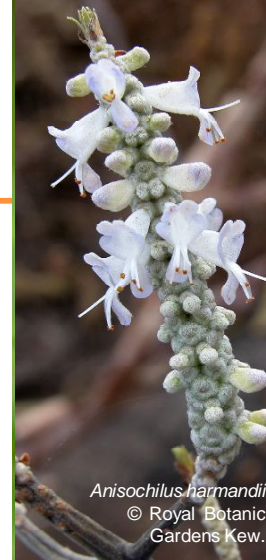
Anisochilus harmandii © Royal Botanic Gardens Kew.

Despite harbouring as many as 11,000 species of flowering plants, some scientists consider Lao PDR to be one of the most botanically unexplored countries in Asia. There have been further significant finds recently however, for example in 2007 the beautiful plant Aeschynanthus mendumiae was recorded 850 metres up on the southeastern slopes of Phou Yang, in Nakai Nam Theun, Khammouan Province 36 . Also in Nakai Nam Theun, the delicate blue flowering Gentiana khammouanensis was discovered the same year 37 . Even with such a large number of hidden botanical secrets uncovered, scientists say that they still know very little about the plant species of the Greater Mekong.