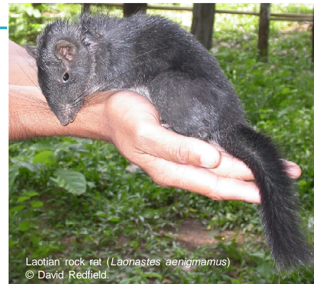
Laotian rock rat ( Laonastes aenigmamus)