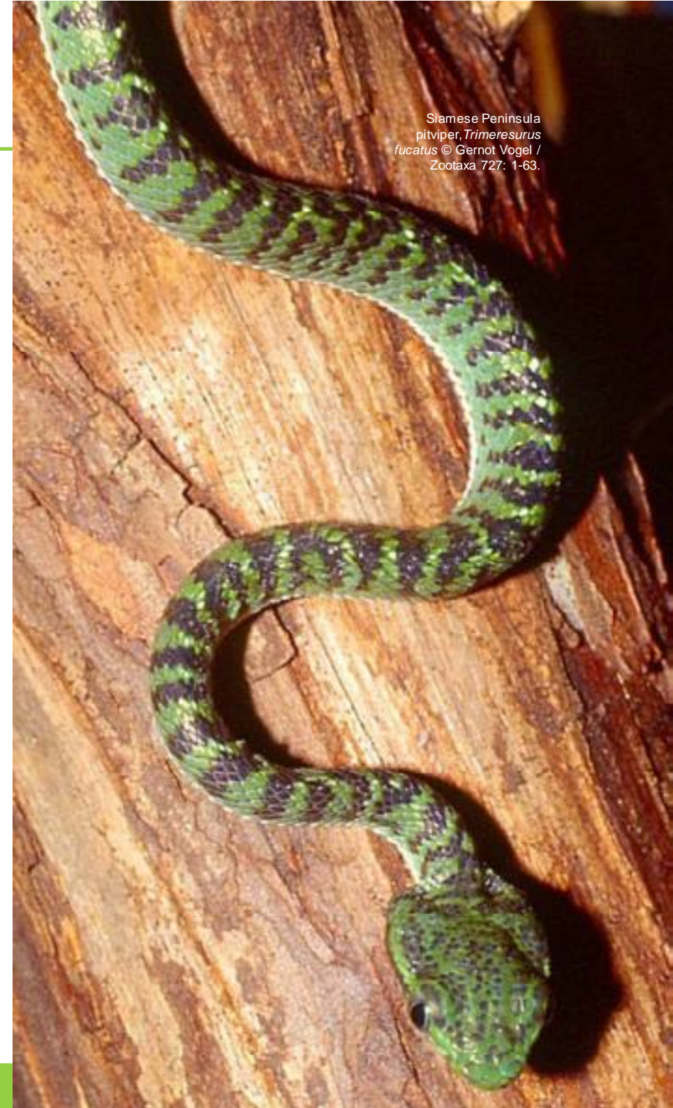
Siamese Peninsula pitviper, Trimeresurus fucatus

New members of the colubridae family of snakes have been described from Vietnam. The white-lipped keelback ( Amphiesma leucomystax ) surfaced in several locations in 2007 48 including within Vietnam's Green Corridor, an area renowned for its high biodiversity. The species tends to live by streams where it catches frogs and other small animals. It has a beautiful yellow-white stripe that sweeps along its head and red dots cover its body. The discovery added to the country's already abundant number of ten species of Amphiesma .