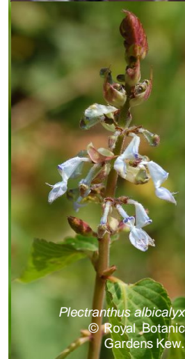
Plectranthus albicalyx