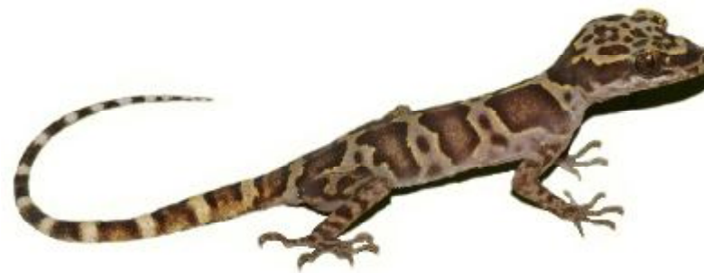
Left: Cyrtodactylus phongnhakebangensis