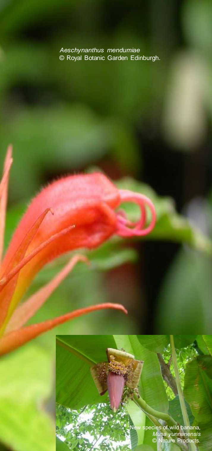
New species of wild banana, Musa yunnanensis © Nature Products.

These new species join an already impressive number of birds found in the Greater Mekong.