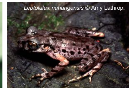
Leptolalax nahangensis