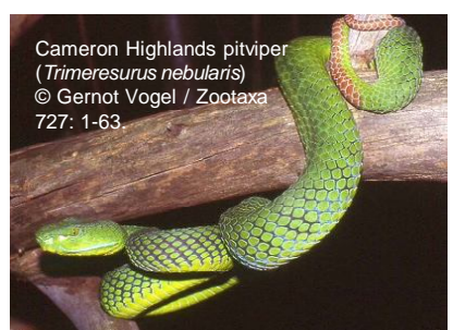
Cameron Highlands pitviper ( Trimeresurus nebularis )