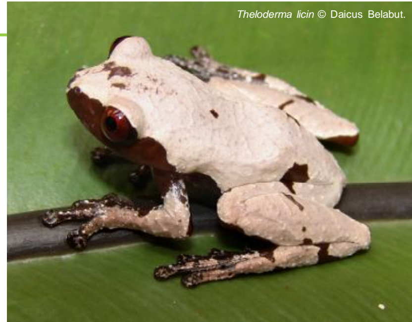
Theloderma lacin © Daicus Belabut.