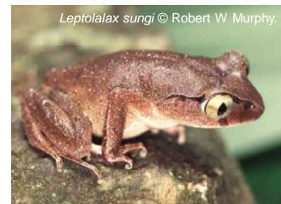
Leptolalax sungi