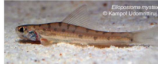
Ellopostoma mystax © Kampol Udomrittiruj.