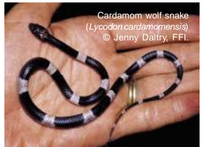
Cardamom wolf snake ( Lycodon cardamomensis )