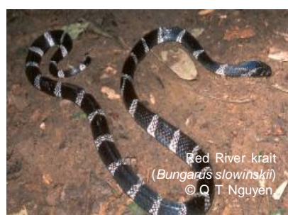
Red River krait ( Bungarus slowinskii )