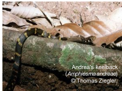
Andrea's keelback ( Amphiesma andreae)