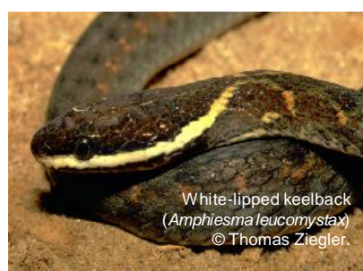
White-lipped keelback ( Amphiesma leucomystax )