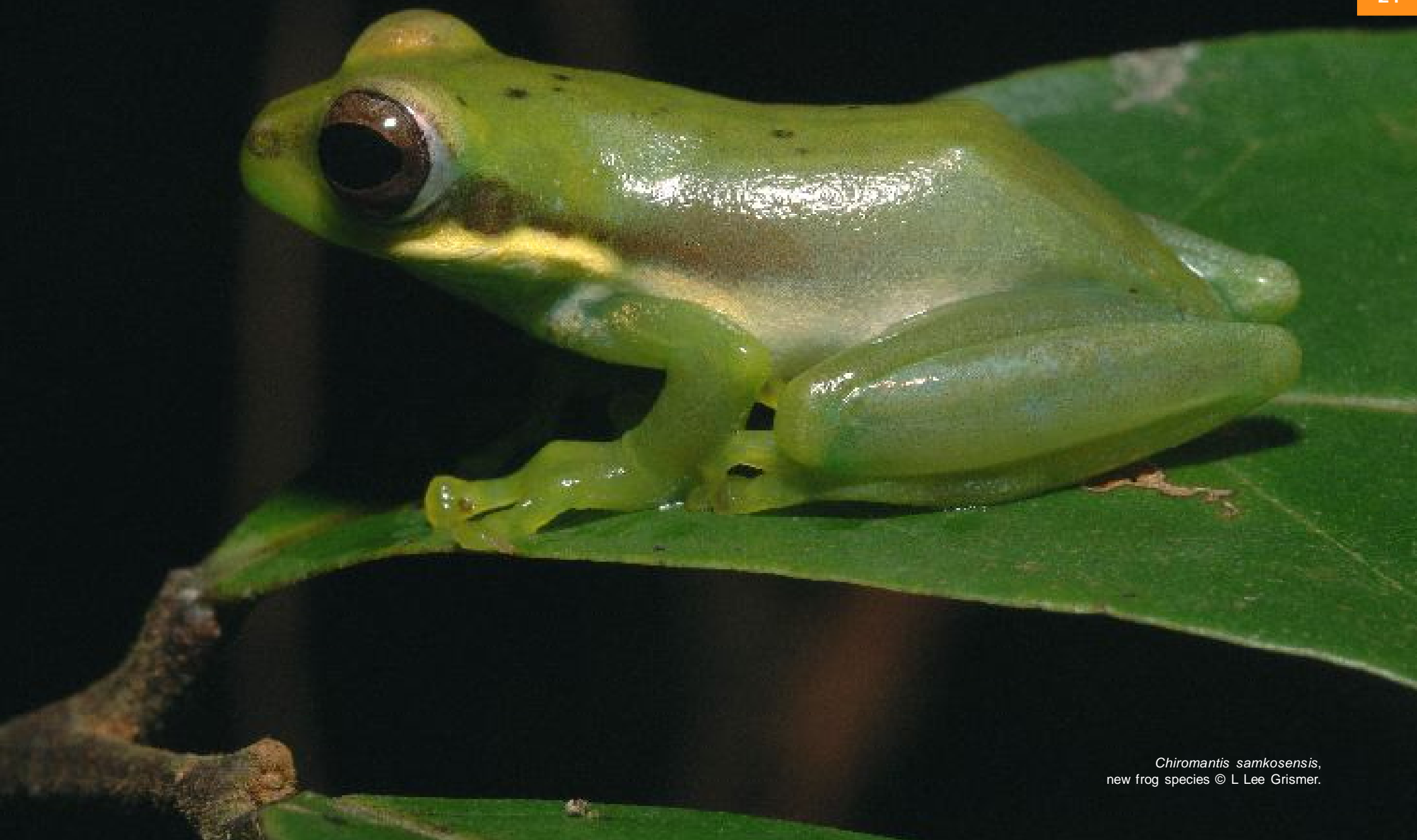
Chiromantis samkosensis , new frog species © L Lee Grismer.