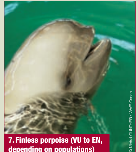
7. Finless porpoise (VU to EN, depending on populations)

Since 2004, WWF and its partners have been working to reduce bycatch of Franciscana dolphins in Argentina. WWF's associate organization, Fundación Vida Silvestre Argentina (FVSA) along with the local NGO Aquamarina - CECIM tested the use of bottom hand-lines as an alternative fishing practice to replace gillnets in Bahia Samborombon and Cabo San Antonio, Hand-lines involve the use of hooks rather than nets, and are therefore much more selective in what they catch. Local fishermen participated in trials using both handlines and gillnets; landings of both fishing gear were compared and showed that longlines capture larger fish in size but a smaller volume of fish. A team of fisheries economists are currently running an analysis of yields but the fishermen are not too optimistic about it. In order to move on towards effective solutions to this problem, WWF is now testing with the same group of fishermen the use of reflective gillnets (winner of Smart Gear Competition 2007; see www.smartgear. org) and will compare bycatch of Franciscana dolphins with the ordinary gillnets.