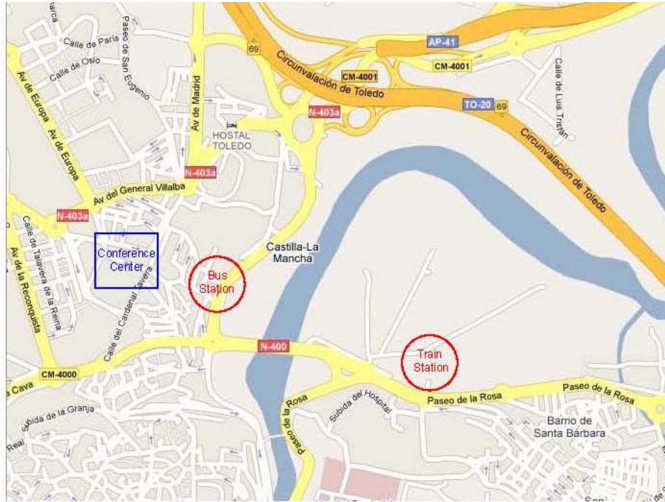
Map 1: City of Toledo. Conference center and transport stations